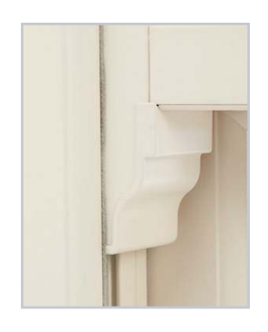
Sash Horns in 3 styles