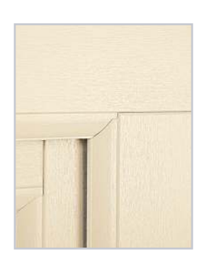
Colour and Texture