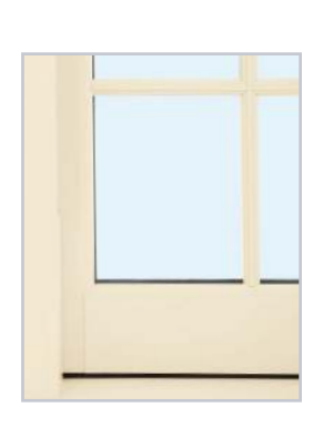
Deep Base Rail